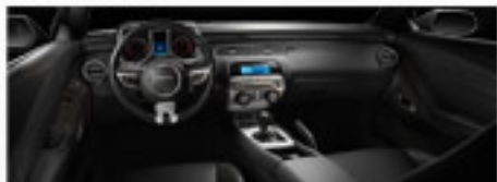
Black, Leather-appointed front seats