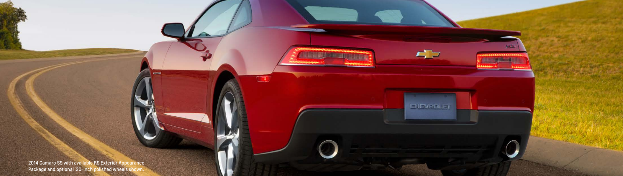
2014 Camaro SS with available RS Exterior Appearance Package and optional 20-inch polished wheels shown.