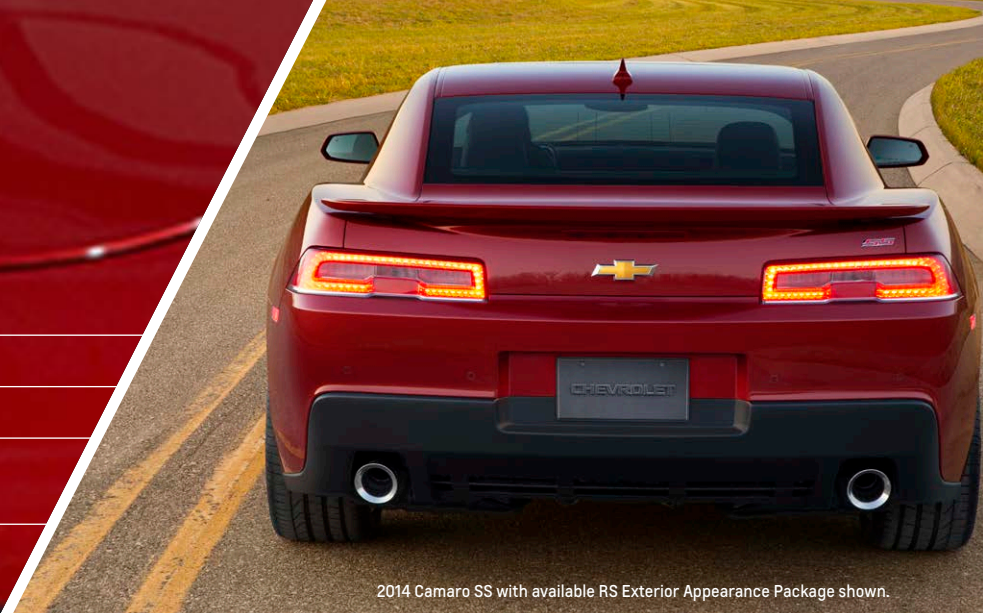
2014 Camaro SS with available RS Exterior Appearance Package shown.

Z/28 information will be supplied at a later date.