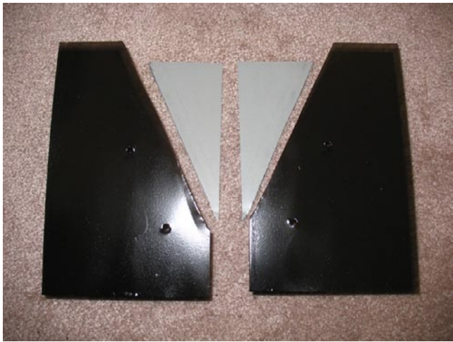
Cut & Painted