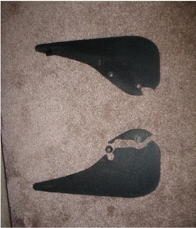
Front flaps after less than 4 months and 900 miles.

I wasted over $60 buying the Stealth mud flaps from RPI Designs. They are made from cheap crap plastic which fell apart in less than 4 months. The rear flaps attach in a retarded way, and I decided not to replace them. The front flaps use 2 existing screws to mount, and are much stronger.